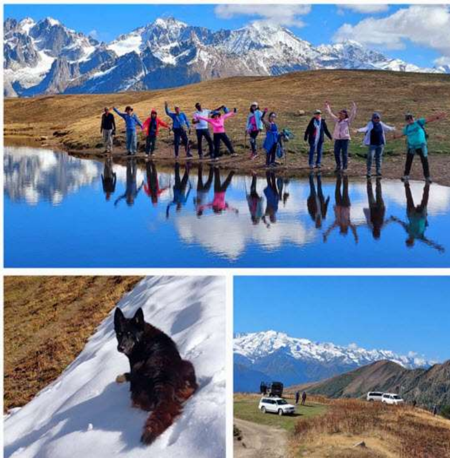
Lake Koruldi Mestia

Day 8 Mtshekta Kutaisi. From ancient capital to vibrant and pretty Kutaisi. We switch to a Mercedes Sprinter for the short 25km drive will bring us to the Georgian old capital of Mtshekta. We visit the 6th century Jvari Monastery, a church that has remained almost unchanged, and the 11th century Svetitskhoveli Cathedral, a UNESCO World Heritage site. PM : Continue our journey another 147km to Kutaisi, Georgia's second largest and most central city, We should arrive early evening in time to catch splendid sunset from Gelati Monastery on a hilltop overlooking Kutaisi. O/n Kutaisi (B).