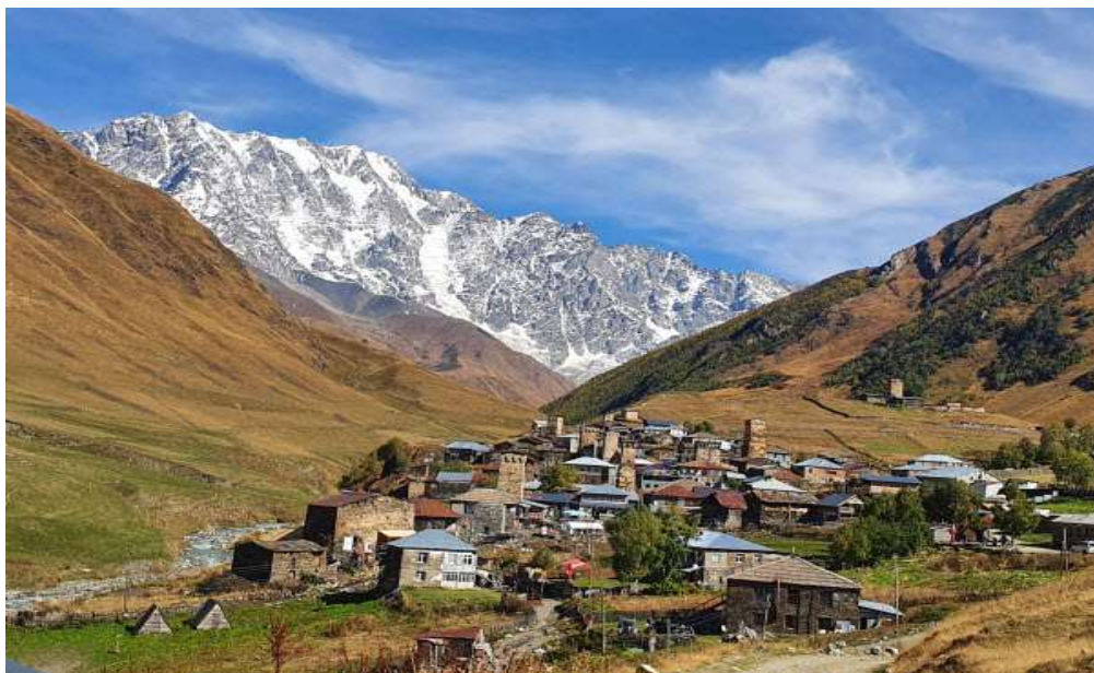
UNESCO list Ushguli Village in Mestia